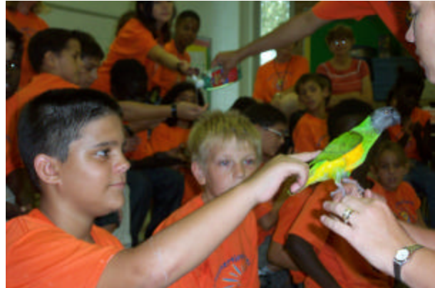
Participants in the Refugee Youth Summer Camp enjoy an activity with animals

Since economic self sufficiency is the foundation of the refugee program, the partnership with Northeast Florida employers is vital to the success of refugees. LSS appreciates the support of the Northeast Florida business community.