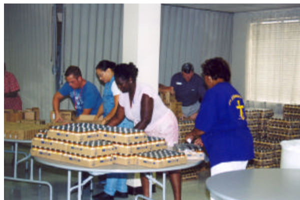
Staff and volunteers prepare to deliver food via a Mobile Pantry event

Multiple events throughout the year supported the effort to end hunger in Florida and across the United States. In October, the Society of Design Administration and the American Institute of Architects showcased their talent by designing giant sculptures made entirely out of canned foods. Food and food products used in the designs were