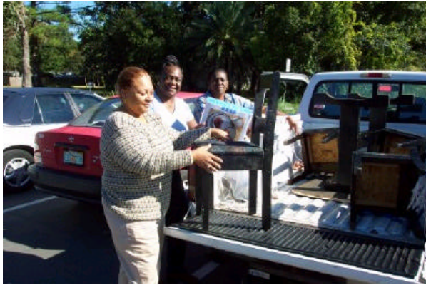
Staff prepare to deliver donated household furniture to clients who participate in the ACE housing program.

Few Americans remain untouched by the HIV/AIDS epidemic. More than 90,000 people in Florida live with HIV/AIDS. Although AIDS is currently the leading cause of death among all people ages 25-44, advances in medication and therapy have made it possible for persons to live longer and recover their quality of life.